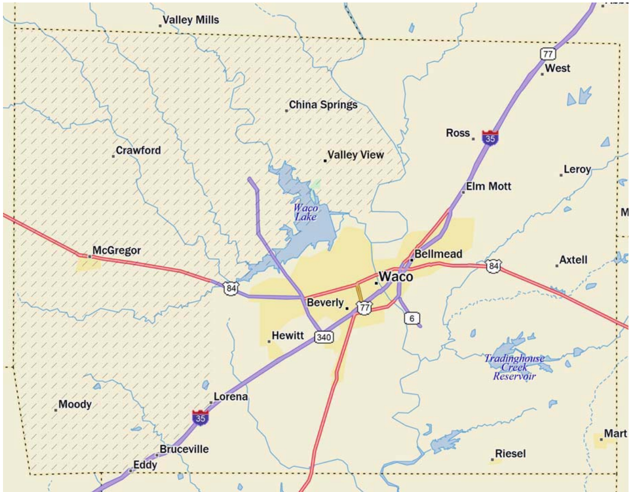
Exhibit A.: Hensell Management Zone (shown as hatched area)