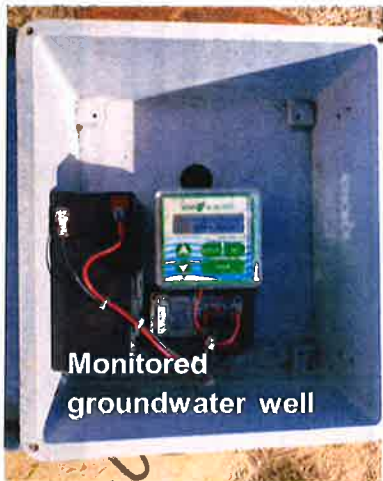
Monitored groundwater well